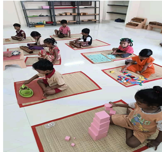
Class in progress at Ezhil Nagar