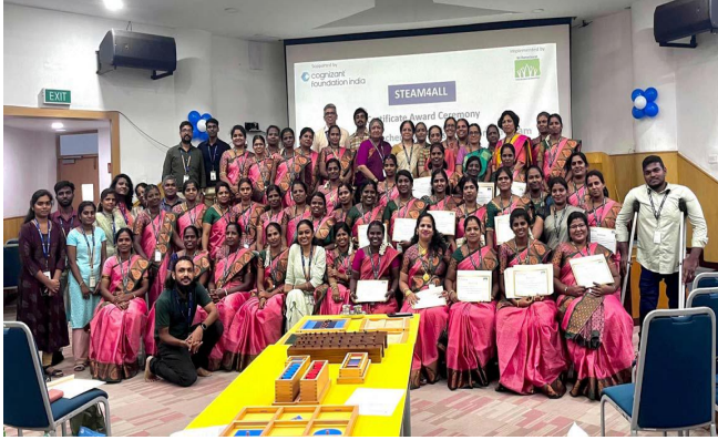
Montessori training Certificate Awardees