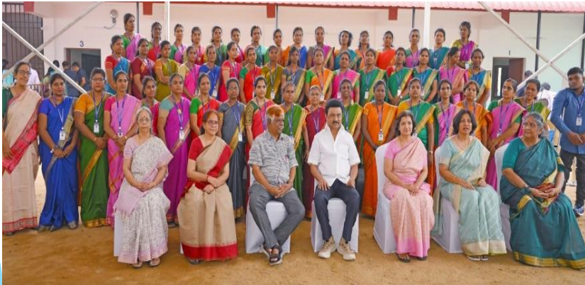
Hon'ble CM of TN with the SRCT team